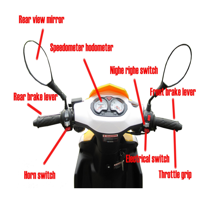
REAR VIEW MIRROR FRONT BRAKE LEVER SPEEDMETER HODOMETER REAR BRAKE LEVER CAL SWITCH HORN SWITCH THROTTLE GRIP